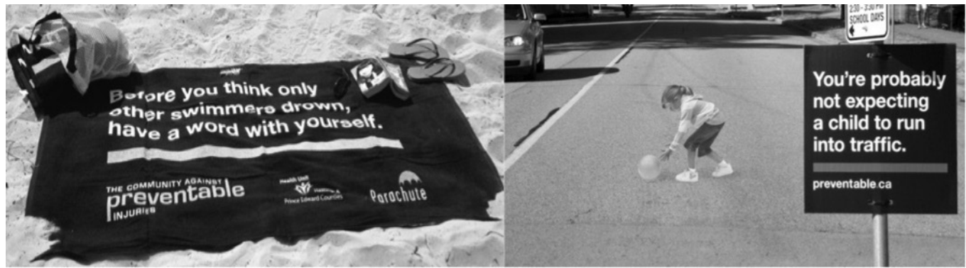
Figure 3 Preventable messaging at the time and place that injuries are likely to occur.

evaluation tended to be more fatalistic about injuries, indicating that it is not feasible, or even desirable, to prevent all injuries. These parents felt that children needed freedom to test their limits and that some risk was the cost of the learning experience vital to normal healthy growth and development. At the same time, they expressed a strong need to set a good example and take more precautions when in the presence of their children. These findings are reflected in the current study, with parental status predictive of higher scores on preventability and conscious thought.